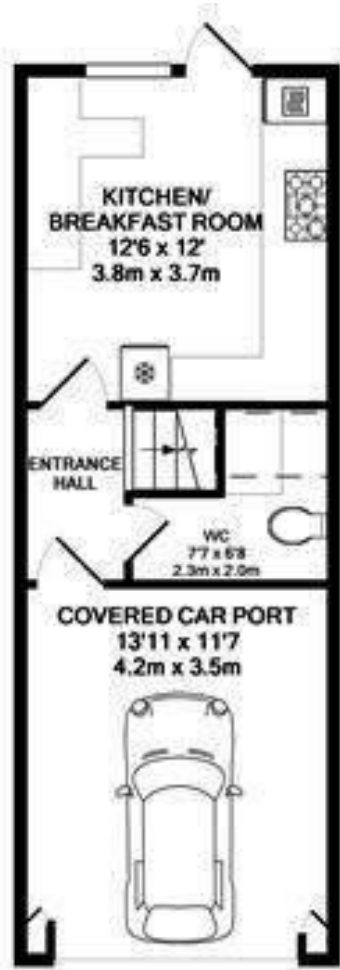
GROUND FLOOR APPROX. FLOOR AREA 383 SQ.FT. (35.5 SQ.M.)