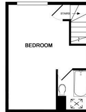
2ND FLOOR APPROX. FLOOR AREA 223 SQ.FT. (20.7 SQ.M.)